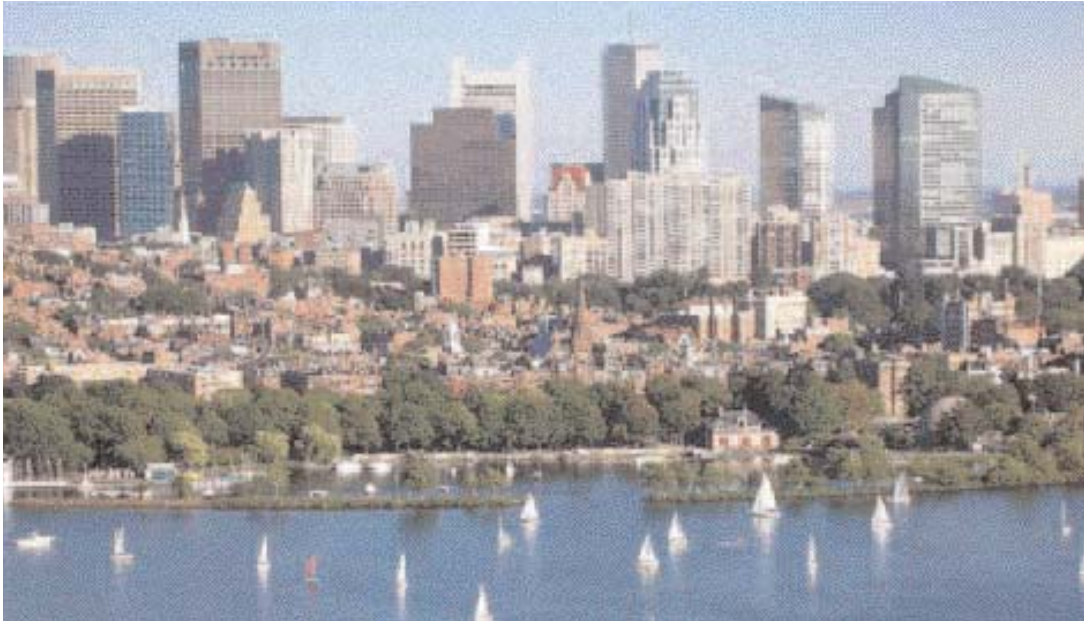
The Metropolitan Area Planning Council in the Greater Boston region has prepared a comprehensive series of regional studies for the area's future growth based on extensive consultation with public, private and civic stakeholders.

years, most recently in 1996. They are long-range, regional strategies that have influenced the three state legislatures and helped shape the region's transportation and open space systems.